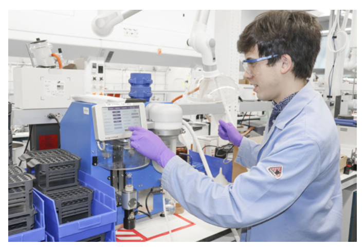
The quickest route to dry product. "I can knock out 16 purifications with the Isolera and then dry them on the V-10 quicker than using a rotavap and round-bottom flasks without risk of solvent bumping."